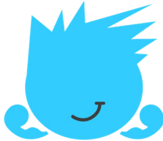
LITTLE HERCULES FOUNDATION